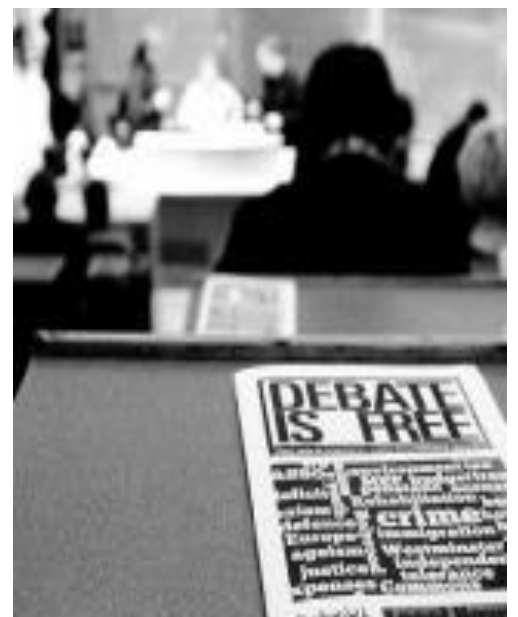
DEBATE IS FREE

With such keen and promising debaters in our midst, it is fair to say that the country's future is looking promising.