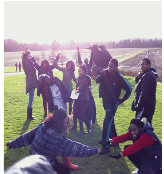
“ASPIRING YOUNG SINGERS”

Well done to all involved. It was a fantastic weekend and you were a credit to the school.